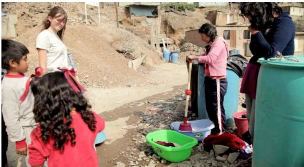
Figure 1. Exemplary Designmatters projects such as Safe Agua Peru, immerse students in the field for design development and testing.