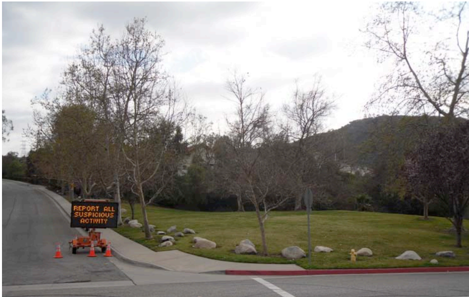
Figure 9. Public Space redefined: panoramic view of hillside landscape surrounding Art Center College of Design.