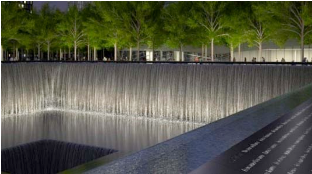
Figure 4. View of the 911 Memorial designed by architect Michael Arad and landscape architect Peter Walker.