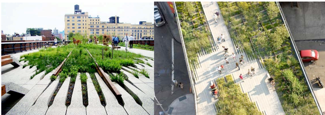
Figure 5. View of the High Line, designed by James Corner Field Operations (Project Lead), Diller Scofidio + Renfro, and planting designer Piet Oudolf.