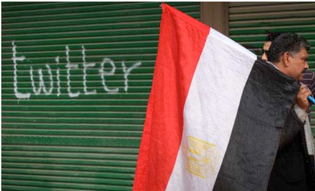
Figure 7. A shop in Tahrir square, Cairo, is spray painted with the word "Twitter" during the Egyptian uprising.