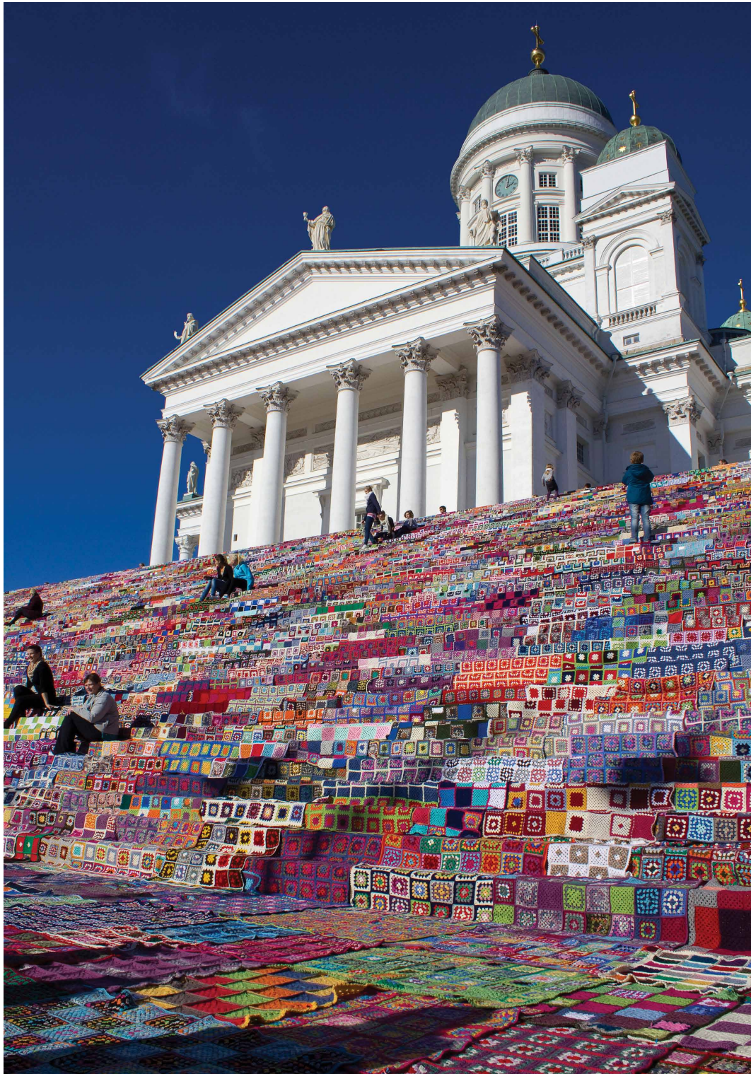
Figure 3. Charity knitting has also found its way to urban art. In October 2011 the steps of the Helsinki Cathedral were covered with woollen baby blankets made of hand-crocheted “granny squares”. The steps were overlaid with 152 000 crochet squares, i.e. 3 800 blankets, a total coverage of 35x60 metres. It was proposed for the Guinness Book of Records as the world record of the biggest blanket. The work was knitted by volunteers and the whole project was organised by the Martha Organization, Textile Teachers’ Association and Novita company. After the world record attempt all the blankets were donated to charity.