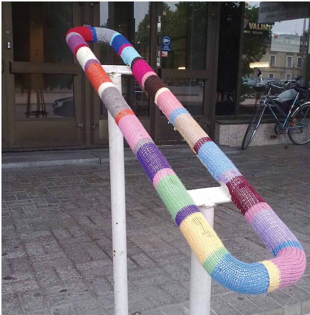
Figure 10. Sometimes a piece of knit graffiti obviously comments on the surrounding environment. The work of Elina Arpiainen aka Knit Sea called Need support? (2009) is attached to the banister of Kela, the Social Insurance Institution of Finland building in Tampere.

Crafts are usually made in the middle of daily routines. They are engaged with everyday life. (Mäkelä, 2010) Even when they move to the worlds of art or urban art, they still have that humble nature. Soft art offers a contrast to the masculine and massive public art. The impermanence of crocheted and knitted artworks set against the infinity of these art monuments.