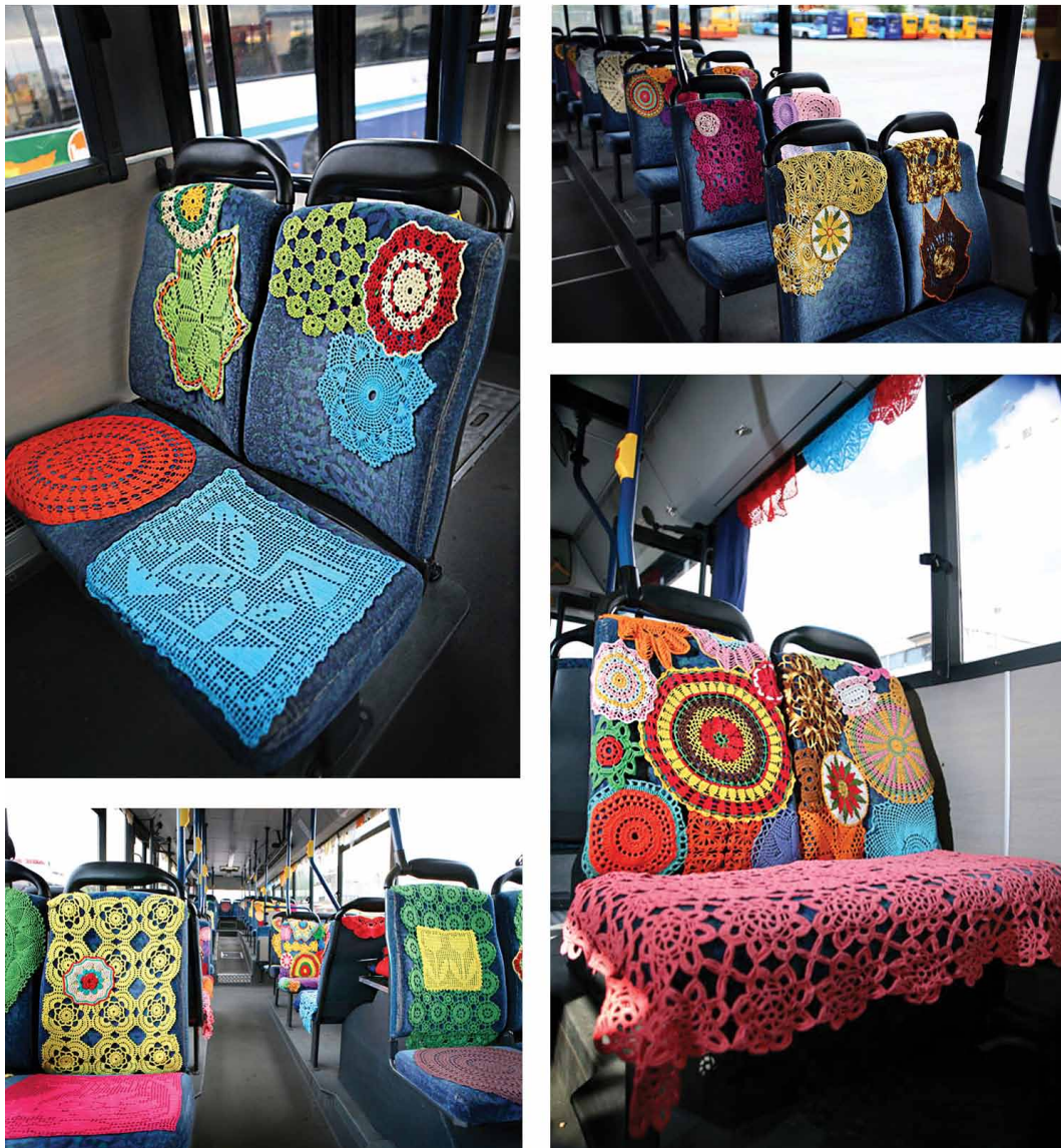
Figure 4–7. Graffiti and vandalism in public transport is a big issue for cities. The Crochet Line (2008) installation by textile artist Virpi Vesanen-Laukkanen provides a softer alternative to the problem. The buss the seats of which were covered with crocheted tablecloths was driving on bus line 55 in Vantaa, Finland in September 2008. The artist explains the idea on her website: "The Crochet Line creates positive feelings that connect to everyday life. Travelling by bus is a smart climate choice and millions of people each day use this form of travel. The aim is to elucidate joy, colour and humour that are so often lost in daily travel. With playfulness and nostalgia, passengers can be activated and enticed to communicate with one another or get in touch with their memories."

2012). So, some adore graffiti and others say that it makes the city feel insecure, violent and ghetto-like. Anyway, despite its aesthetic value, real street art, graffiti, is illegal in Finland.